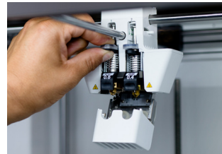
Print core CC Hardened steel nozzle for printing abrasive glass and carbon fiber composites. Available in 0.4 and 0.6 mm